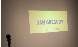
Bentley Project - Jan '14