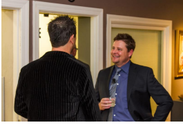
Collaboration - Feb '14

recent Chapter event, see what you've missed: