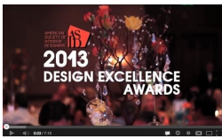
Design Excellence - 2013