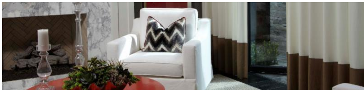
Ardy's Custom Workshop