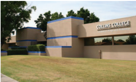
Collins College, Tempe.