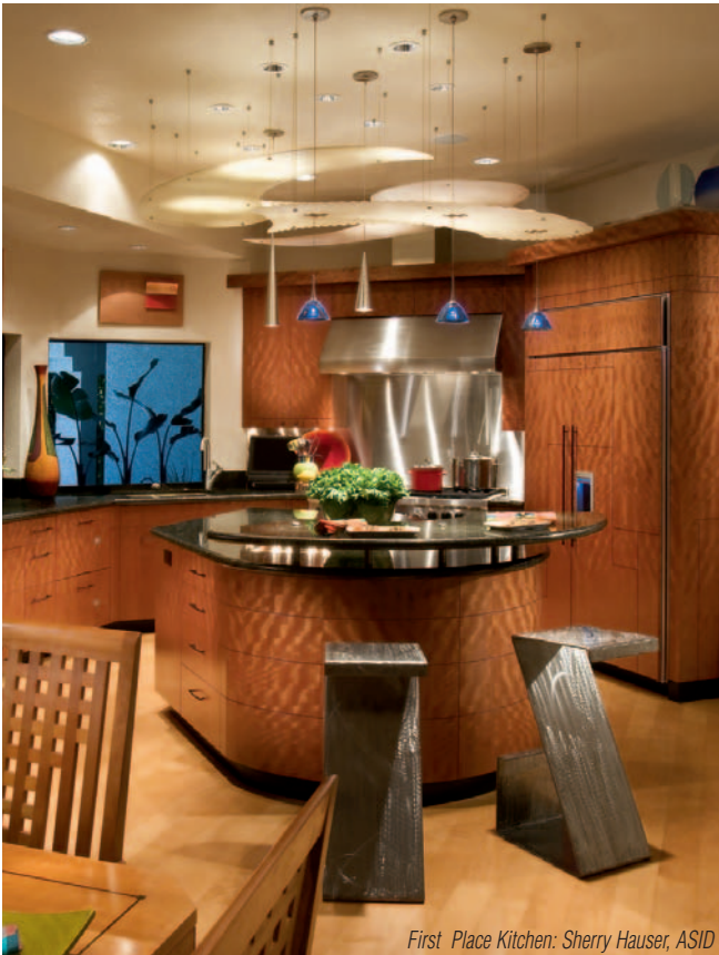
First Place Kitchen: Sherry Hauser, ASID